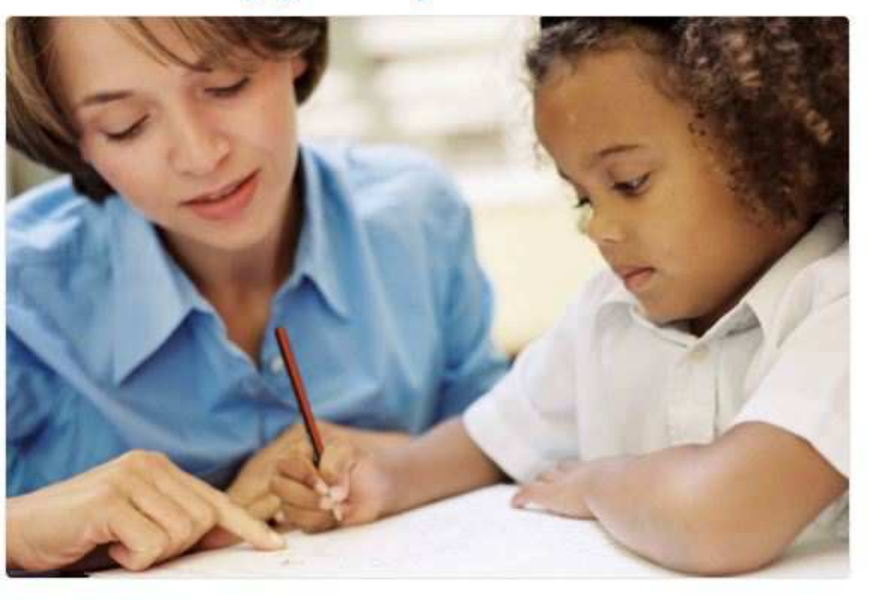
9:31 AM - 5 Jul 2017

The @librarycongress uses #mail to help young people learn more about literature. #LetterWriting go.usa.gov/xNHAA